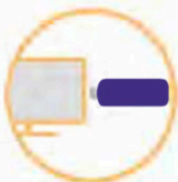
HDTV + ROKU